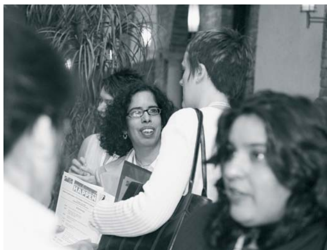
RDA delegates networking

strategic lead in moving Women's Enterprise forward. However, 73% of those present also felt that RDAs did not have the appropriate knowledge and resources to do this.